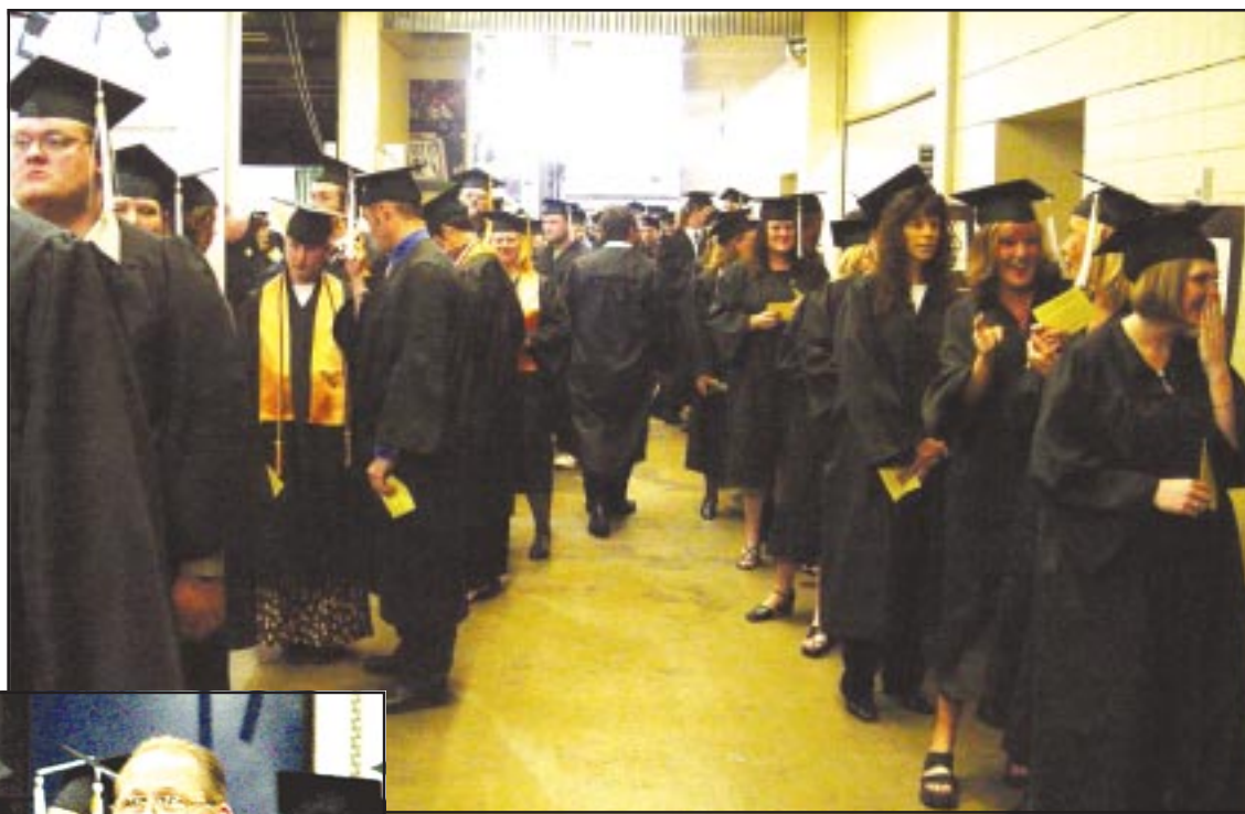
Students passed the time backstage by chatting and fixing each other's tassels.